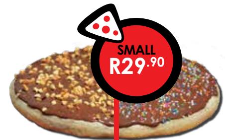
Sprinkled nuts | 100's & 1000's

(When available) Nutella chocolate spread, topped with either sprinkled nuts or 100's & 1000's